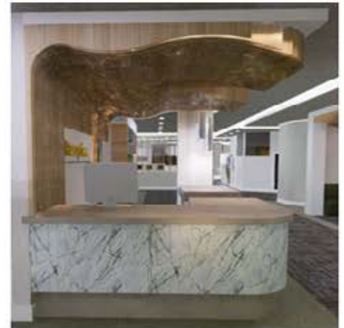
reception side view render