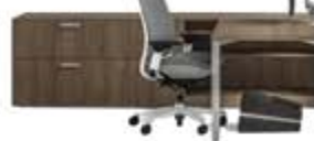
steelcase - currency desking system