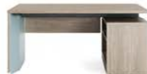
Steelcase slim leg height - adjustable desk