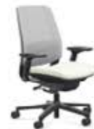
Steelcase office chair - aria - aria air