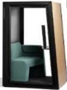
steelcase on the go workstation