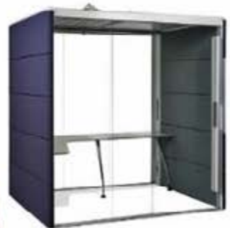
steelcase all 3 - pods

lithonia lighting - ultra thin 4 inch red water downlight