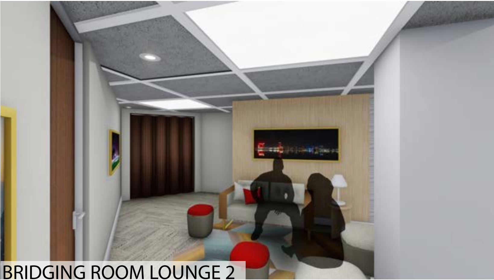
BRIDGING ROOM LOUNGE 2