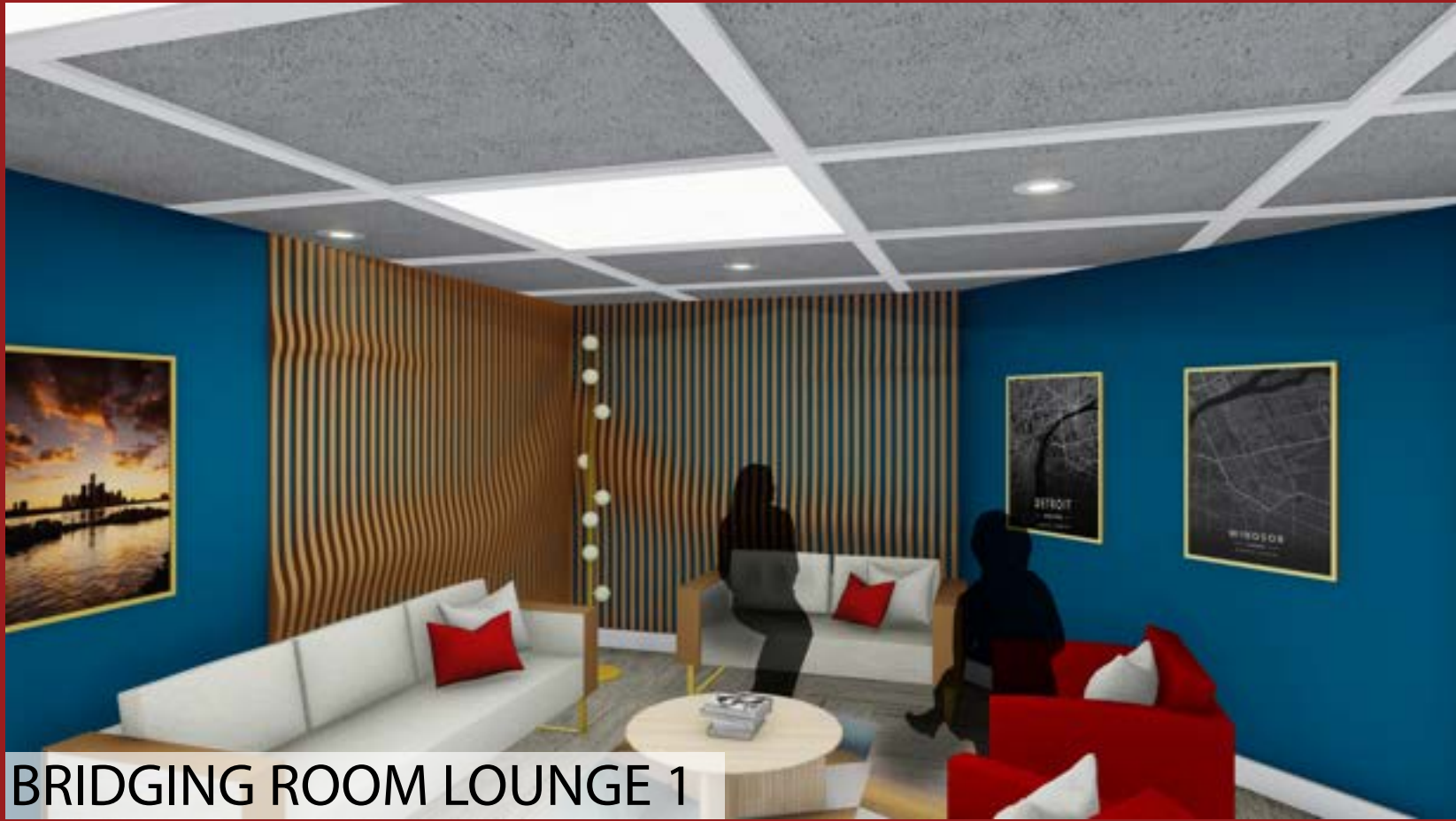
BRIDGING ROOM LOUNGE 1